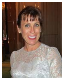
President & Founder

https://www.facebook.com/JuntosPorCamboya/